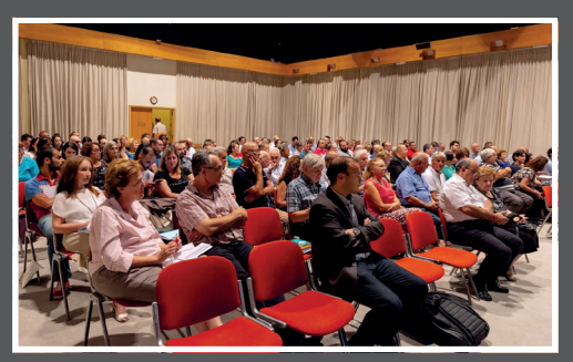
This seminar was attended by various voluntary organisations.